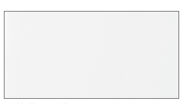
Rubbed lacquer white 11