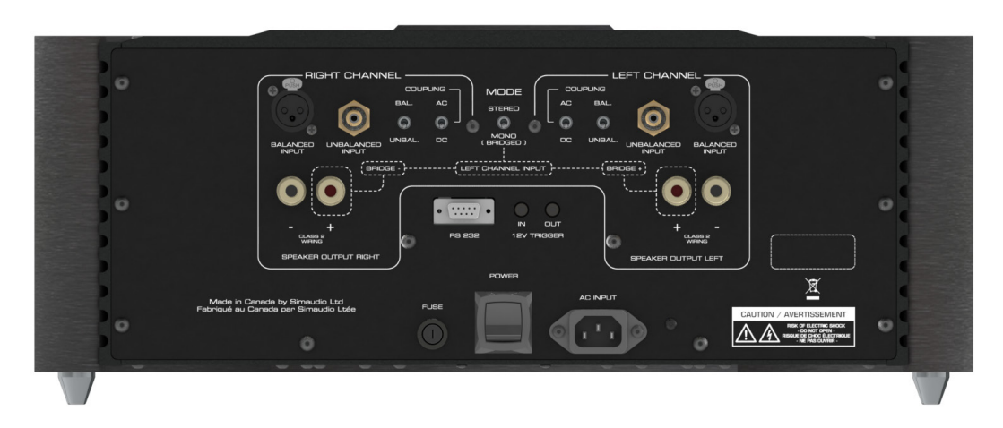
Figure 1: 860A v2 Rear panel